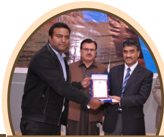
Best Young Researcher of the Year