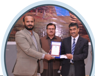
Best Researcher in Pharmacy