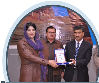
Rising Star of the Year