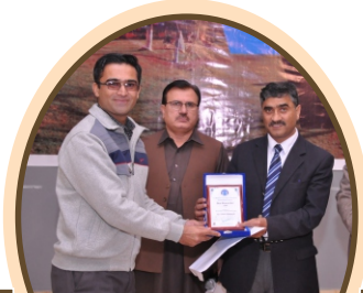
Best Researcher in ECE