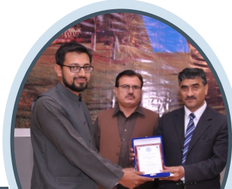
Best Researcher in CS