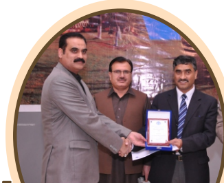
Best Researcher in Mathematics