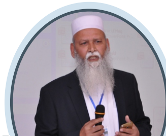
Best Researcher in MS