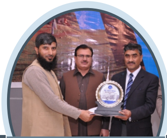
Best Researcher of the Year