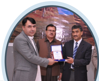
Best Researcher in ES