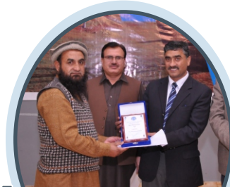
Best Researcher in Earth Sciences