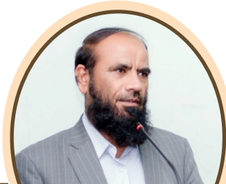
Best Researcher in DS